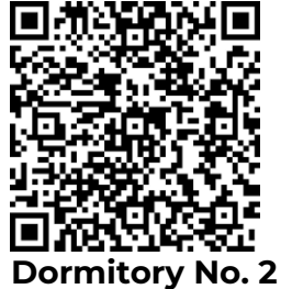
2A Nebesnoi Sotni Str.